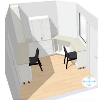
After (photos to follow)